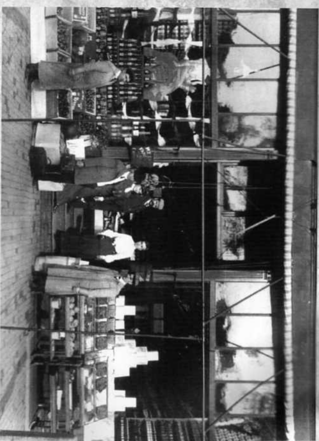
The Tondreau Family